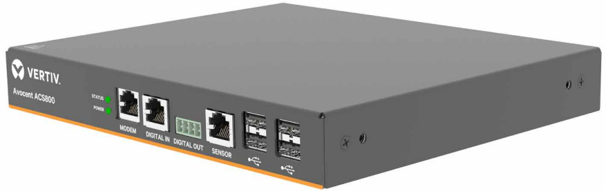
Avocent® ACS 800 Serial Console for the Edge

The Avocent ACS 800 serial console system takes our renowned enterprise class technologies utilized in data centers around the world and packages the key features into an exciting compact and cost effective form factor. Providing serial access, environmental monitoring, IoT integration and remote networking capability to the Edge oriented market sectors of financial institutions, retail chains, education and others.